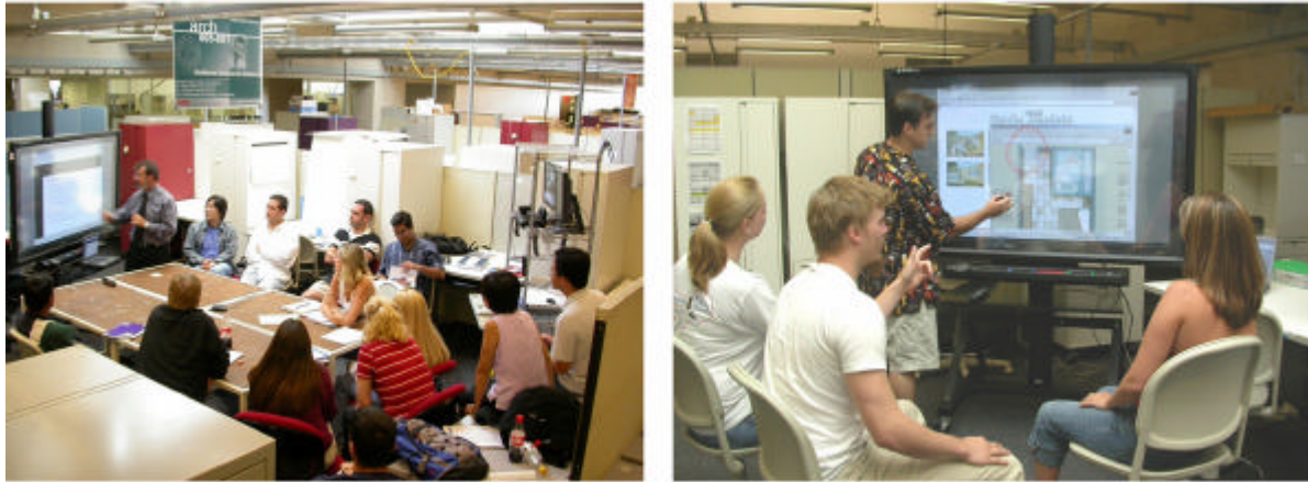
FIG. 4: A studio at Texas A&M University in which an interactive plasma screen is used for conducting electronic reviews. The following URL address contain the archived stream videos of electronic reviews that illustrate the interaction of students and professors with electronic pin-ups on a 61" interactive plasma screen: http://archone.tamu.edu/~gvv_f03/

Please note that in order to view properly the stream videos you must install RealOne Player in your machine.