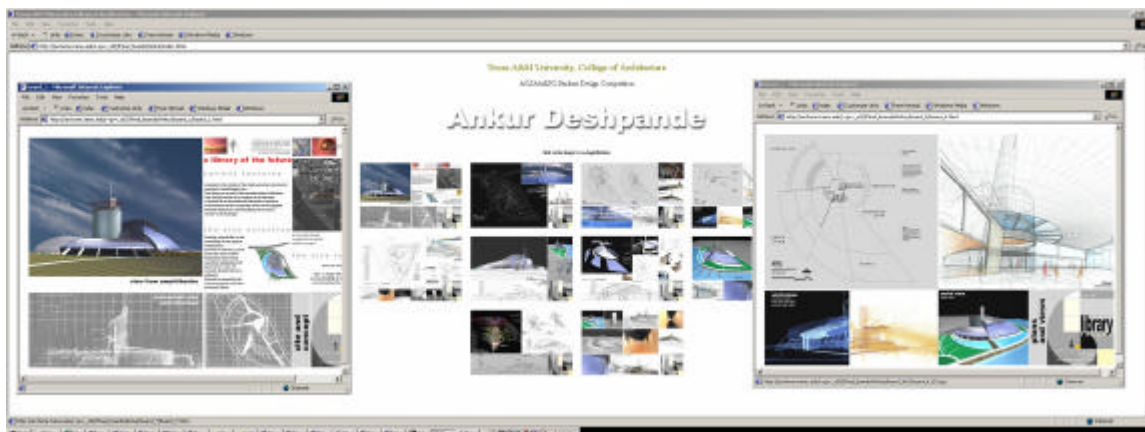
FIG. 2: Electronic Pin-up of second semester M.Arch student. The actual electronic pin-up is available at: http://archone.tamu.edu/~gvv_f02/Class_f02/Final_boards/Jin_rao/index.html