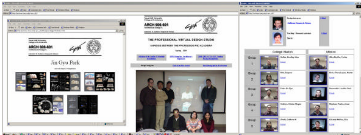
FIG. 3: Web site of a Virtual Design Studio in which students of Texas and Mexico collaborated under the guidance of architects in the firm SHW Inc.: http://archone.tamu.edu/~gvv_s01/

Electronic Pin-ups continue to provide service in their original role in Virtual Design Studios. By means of Electronic Pin-ups virtual reviewers can visit the design work of our students and deliver valuable comments. Virtual reviewers extend the review capacity of the professors of record and in some cases bring a new perspective into the development of the projects. This is in particular true when professors in other countries or architects in professional offices question the default and/or academic design decisions of our students. The following URL address illustrates the implementation of Virtual Design Studios that combine an international and professional dimension: