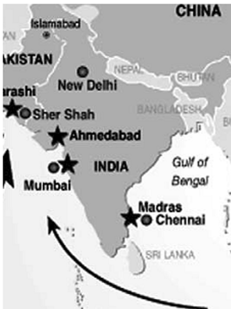
Figure 2 Major Indian ports receiving E-waste.

Over 1 million poor people in India are involved in the manual recycling operations of E-waste and most of the people working in this recycling sector are the urban poor with very low literacy levels and hence very little awareness regarding the hazards of e-waste toxins. There are a sizeable number of women and children who are engaged in these activities and they are more vulnerable to the hazards of this waste. The following three categories of WEEE account for almost 90% of the generation: