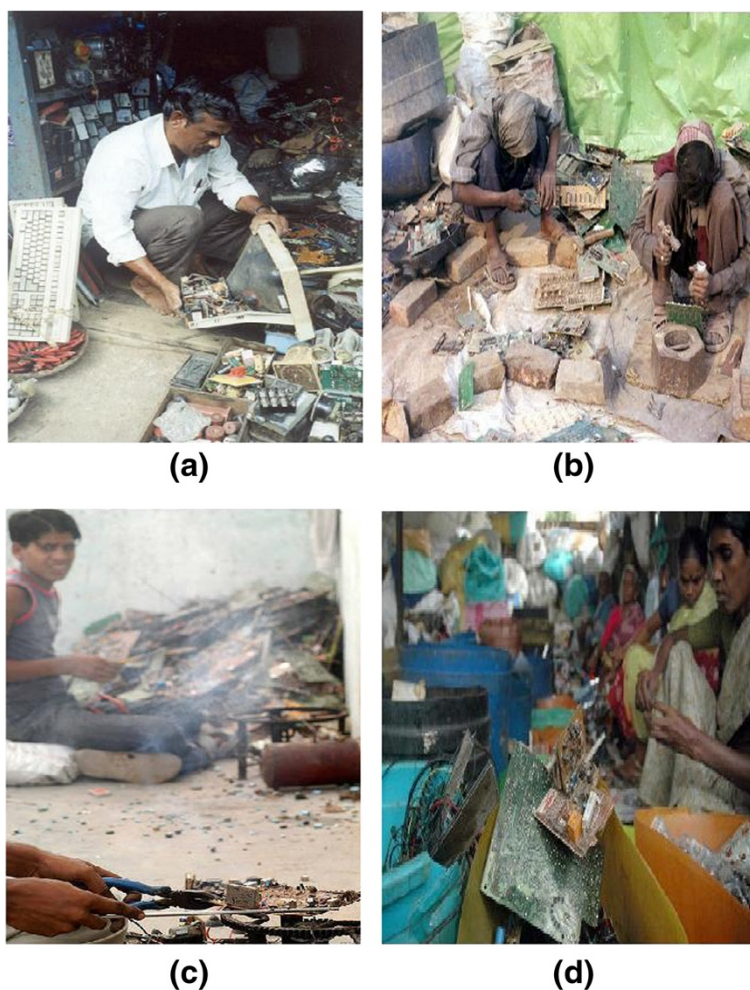
Figure 3 E-waste recycling units in India. (a): E-waste dealer sorting through waste in Chennai. (b): Children recycling toxic e-waste with their bare hands, Delhi. (c): Children extract copper from discarded computer parts. New Delhi. (d): Women working in recycling toxic e-waste with their bare hands.

is used when old WEEE are exported to developing countries and they are often labeled as “second-hand goods” since the export of reusable goods is allowed. On the other hand, most WEEE that does work on arrival only have a short second life and/or are damaged during transportation. The main objectives of the Basel Convention are: