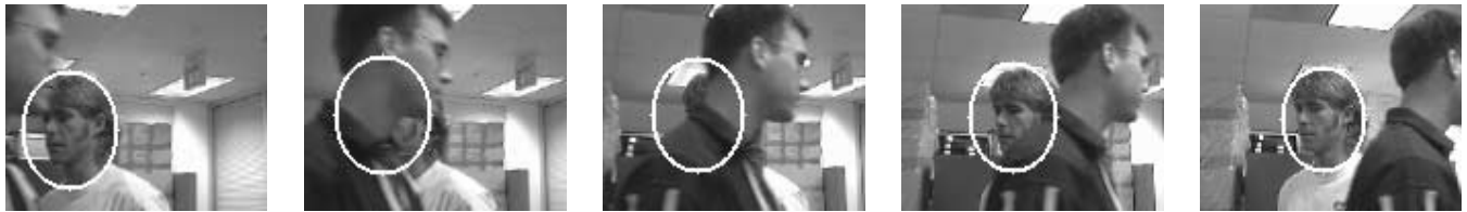
Complete occlusion of the subject by another person