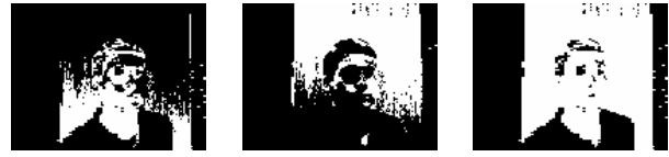
(a) (b) (c)

In nearly every respect, the performance of the color module is superior to that of the gradient module, which should not be too surprising since it looks at more pixels. Alone, this module is capable of controlling the camera’s pan, tilt,