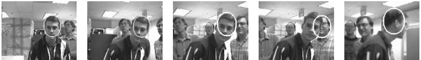
Three people trying to steal the ellipse from the subject