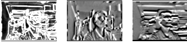
Figure 1: A cluttered background. (a) Gradient magnitude. (b) Horizontal and (c) vertical components of gradient.

each, while the last one contains the luminance information and is sampled more coarsely into four bins [17]. Some researchers have ignored luminance information completely [4, 9], but this is dangerous with out-of-plane rotation because, based on chrominance alone, dark brown hair looks similar to a white wall.