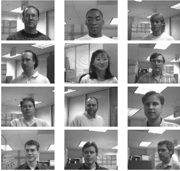
Figure 4: People in the experiments.

handling changes in scale, and providing a larger basin of attraction. In a similar manner, sometimes the gradient module helps the color module.