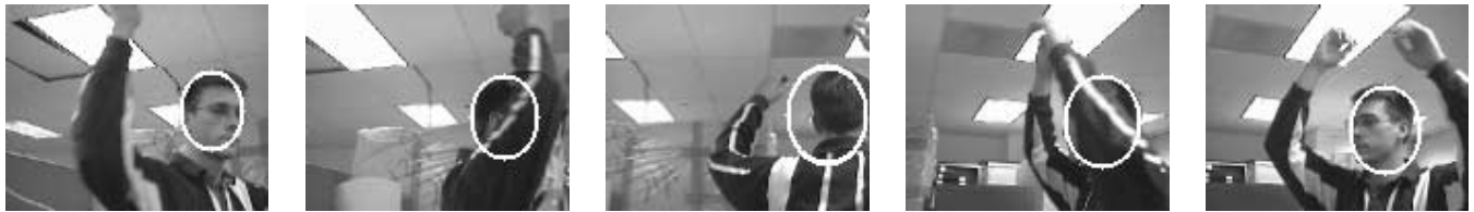
Simultaneous translation, occlusion, and out-of-plane rotation