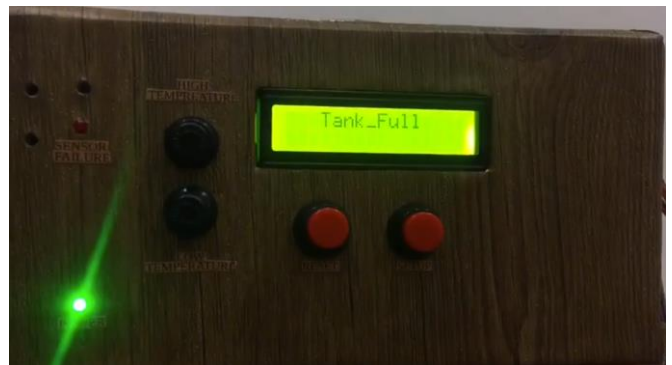
Fig. 5: Tank Level Full