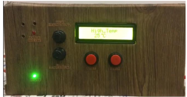
Fig. 3: Starting of the System