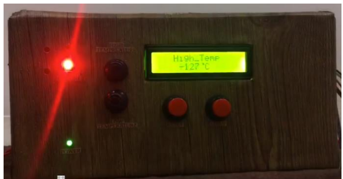
Fig. 6: Sensor Damaged Signal