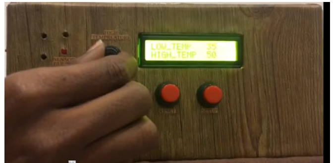
Fig. 4: Setting the Temperature