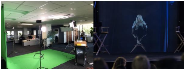
Figure 3. Example of holographic telepresence. Left: presenter's setup. Right: presence at the venue

A logical extension of XR and haptic communications is holographic telepresence . Nevertheless, unlike in the previous two technologies, no headset is needed. In such a case, bandwidth requirements will grow up to terabits. This technology would allow controlling entire physical space with the use of IRS and similar structures. Using special equipment in a studio or laboratory, projection equipment beams users into one or multiple venues. An example of such technology was shown ARTH Media company as a Virtual Global Stage Platform, shown in Fig. 3. However, at the current stage, physical interaction for the user is not possible.