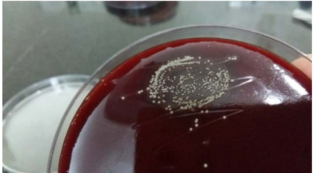
FIGURE 1: Appearance of Kocuria spp on blood agar after 24 hours of aerobic incubation

Kocuria spp do not produce hemolysis on blood agar, unlike most clinical isolates of Staphylococci . They usually form 2-3 mm whitish, small, round, raised, convex colonies on initial isolation and might develop non-diffusible yellowish pigmentation after prolonged incubation, as shown in Figure 1.