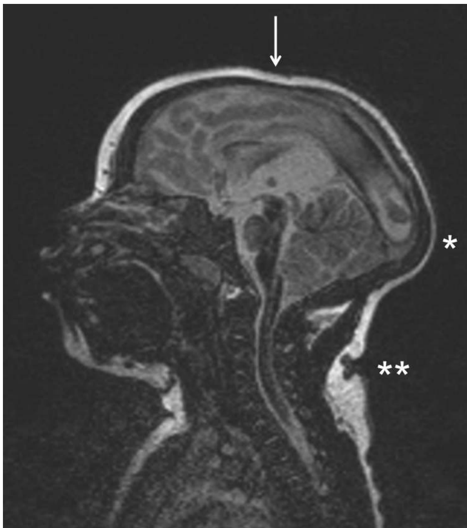
FIG 1 Sagittal MRI image of the head of an infant who was born with a head circumference below the third percentile (microcephaly), under investigation. The arrow shows a collapse of the skull, inducing cranio-facial disruption, an exuberant external occipital protuberance (*), and redundant scalp skin (**).

or neurodevelopmental delay and 43% suffered from epilepsy (21). These results are congruent with findings of another study in which only half of the children with microcephaly had a normal intelligence quotient (IQ) (31). The severity of the neurological impairment seems to be associated with the severity of microcephaly (32). Given the above, the prognosis may be poor for suspected ZIKV microcephaly cases due to a potential early insult to brain development and systemic involvement, depending on the timing of infection. Long-term studies are urgently needed to characterize the prognosis.