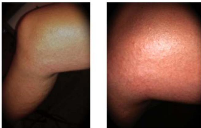
FIG 3 Example of a pruritic maculo-papular rash on a traveler coming back from New Caledonia (2014).

allow pregnancy termination in cases of serious risk to maternal or fetal health, such as Colombia, adequate information is rarely given to mothers, partly due to significant social and religious pressures (269). In that context, the benefit of amniocentesis is questionable.