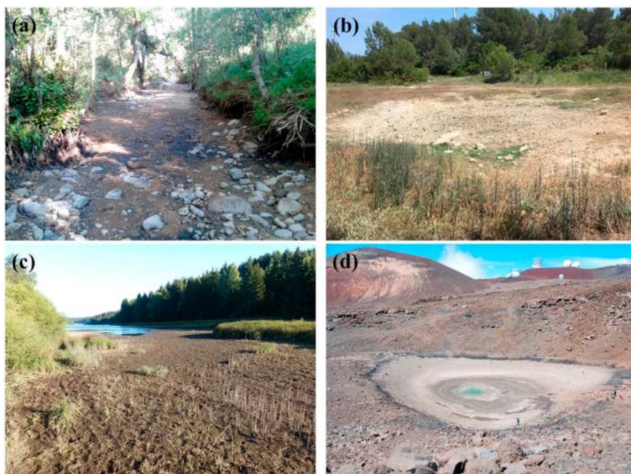
Fig. 1. Photographs of representative dry inland waters. (a) Fuirosos stream (Catalonia, Spain) showing its dry stream bed; (b) Collada pond (Catalonia, Spain); (c) Königshütte reservoir (Saxony-Anhalt, Germany); (d) Lake Waiiau (Hawaii, USA).

and rivers) and lentic (ponds, lakes, and reservoirs) ecosystems in which surface water is absent, and sediments become temporarily or even permanently exposed to the atmosphere (see some examples in Fig. 1). A large part of the global river and stream network shows ephemeral or intermittent flow regimes, i.e. their flow ceases with varying frequency and duration, exposing the sediments of the riverbed to direct contact with the atmosphere (Fig. 1A). Most small ponds seasonally dry at least partially (Fig. 1B), and man-made reservoirs experience recurrent water level fluctuations that expose large areas of sediments to the atmosphere, particularly in the inflow sections (Fig. 1C). Finally, lakes can also totally or partially dry due to changes in climate and water diversion, exposing bottom sediments (Fig. 1D). The dry sections of inland waters tend to be highly dynamic and contract and expand over space and time, thereby occupying a varying fraction of the aquatic network (Stanley et al., 1997). In addition, exposed sediments of inland waters may be subject to different drying intensities due to groundwater influence and rainfall, thus maintaining different levels of moisture after surface water loss (Steward et al., 2012).