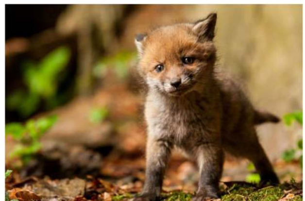
FIGURE 1 | Sample picture of a young fox shown in the photographs condition.

Both of our experimental factors were dichotomous variables, and all of the dependent variables were metric measures. In view of these variable levels, and since we aimed to test both differences hypotheses and interaction hypotheses, we tested our hypotheses by running two-sample t tests (for H1, H4, and H7) and two-factor ANOVAs (for H2, H3, H5, H6, H8, and H9), which are common approaches for analyzing these types of data in general (Aron and Aron, 2002) and in the area of risk communication in particular (e.g., Keller et al., 2006). The significance level was set at p = 0.05 . We provide Cohen's d and partial eta-squared to indicate effect sizes. The following paragraphs depict the results of these analyses that tested each hypothesis.