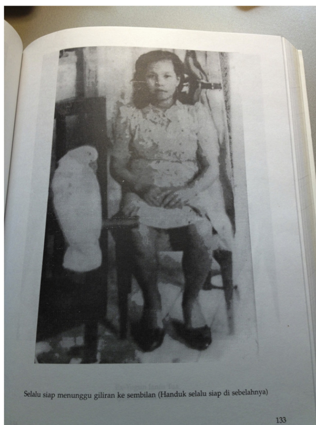
Fig. 1. Always ready waiting for the ninth visit (a towel is always ready beside her).

attributes no blame to militaries for prostitution. Instead, it is the women who prostitute themselves who are the problem. In the context of a military-dominated regime such as Indonesia's New Order, critiques of the military would have been difficult, but I believe members of the Forum were so focused on attributing blame to the Japanese, that they did not see the parallels with the practices of the Indonesian military which also regularly used sexual violence against women (Aditjondro, 1997). This omission, whether deliberate or not, is perhaps also due to their own military backgrounds and/or to a firmly nationalist view of history.