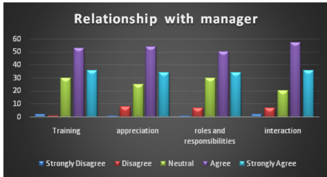
Figure 1. Sample division based on Gender.