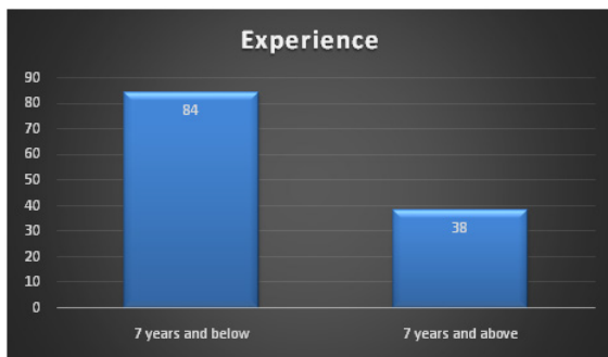
Figure 2. Sample division based on experience.