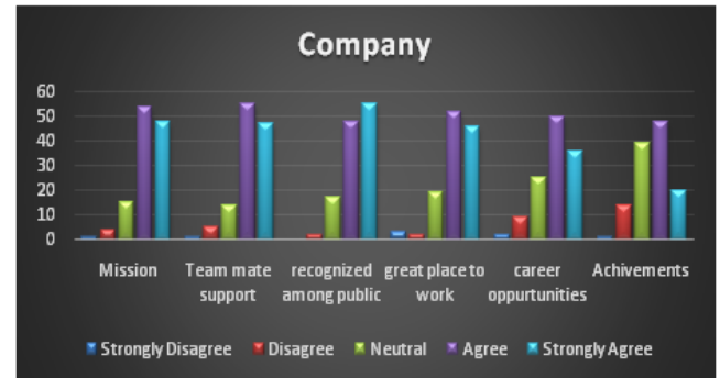
Figure 5. Variables under the factor company.

Extraction Method: Principal Component Analysis. Rotation Method: Varimax with Kaiser Normalization. a. Rotation converged in 6 iterations.