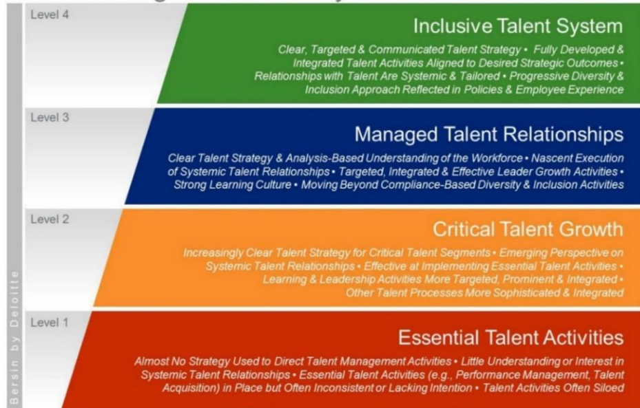
Figure 1. Talent Management Maturity Model (Garr et al., 2015)

What should the talent strategy for the digital age comprise in order to attract high potential youngsters: