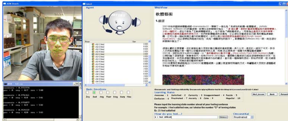
Figure 2: A snapshot of the system