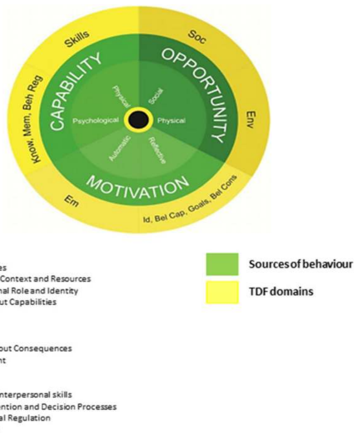
Fig. 1 Theoretical domains framework an elaboration of the COM-B model. Reproduced with permission from Michie et al. [45, 46]

Medical chart review identified a purposive sample of pregnant women with a body mass index ( \geq 25 kg/m 2 ) recruited during pregnancy from a public antenatal clinic at Cork University Maternity Hospital (CUMH). CUMH is a large academic maternity hospital in the South of Ireland where approximately 6657 new obstetrics patients entered in 2015 [53]. Eligible participants were approached individually and informed about the study by the attending midwife and researcher on site at their antenatal appointment. They were