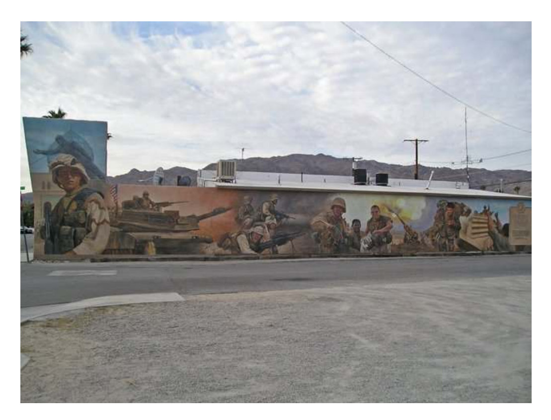
Figure 2: Mural 'Operation Iraqi Freedom' by Don Gray.

Finding Deller's exhibition in the museum that day came as no surprise, as the exhibition had been widely advertised. What shocked me was finding another piece there that offered a very different aesthetic engagement with the US-led War in Iraq - Don Gray's mural 'Operation Iraqi Freedom' (Figure 2). This mural is painted on the side of the Collins Computer Innovations store in Twentynine Palms, California. It depicts the First Marine Division crossing from Kuwait into Iraq, the toppling of the statue of Saddam Hussein in Baghdad, and the dramatic rescue of US POWs in the early days of the war.