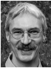
GERHARD WEIKUM Max Planck Institute for Informatics Saarbrücken Germany