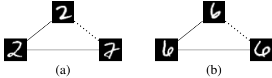
Figure 2: Examples of inconsistent edge labels produced by a stand alone Siamese network on the MNIST digits.

the top/right pair being the same digit is incorrectly estimated. When we partition these digits into clusters, the incorrect similarity estimates introduce invalid cycles. Now the question is whether we can deploy cycle constraints to learn a better Siamese network, resulting in more robust and consistent similarity measures.