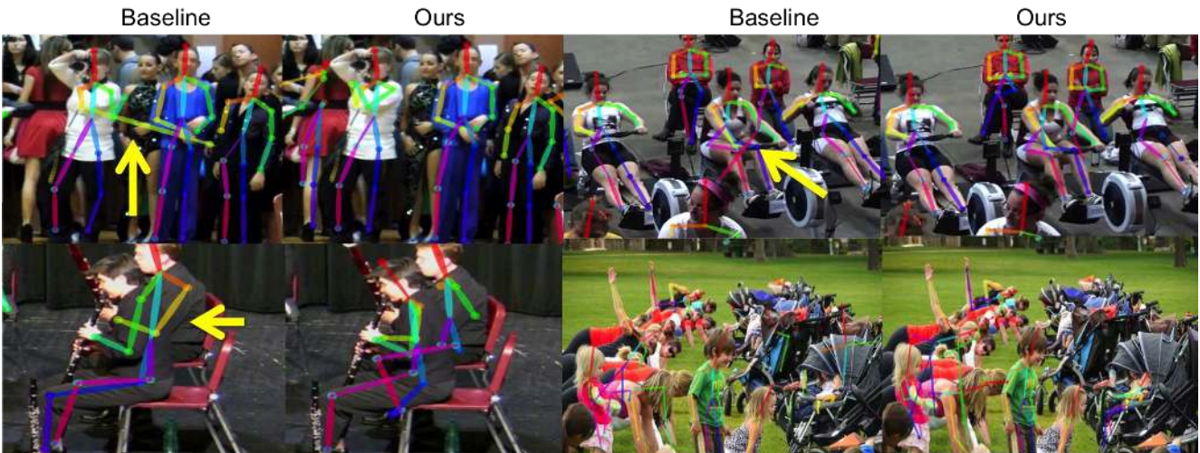
Figure 4: Qualitative Results. Left: association without CRF; Right: association after inference. First row , obvious wrong connections are corrected by inference. In the second row occluded people are separated. The last example is a failure case.

to efficient heuristic solvers to return a feasible graph decomposition. Second, we show notable improvement on the feature learning and validity of the cycle inequality for the multi-person pose estimation task, but the final performance gain on pose association does not support us to outperform the state-of-the-art top-down methods. One reason is that our end-to-end training only operates on the part affinity field, not on the body joint detections, which is crucial for the final result. To include the body joint detections in the end-to-end training pipeline is a practical future direction. Nevertheless, We think that this work adds an important primitive to the