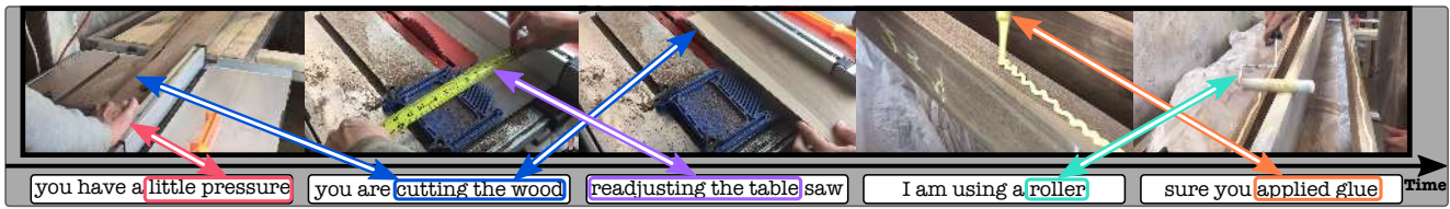
Figure 1: We describe an efficient approach to learn visual representations from misaligned and noisy narrations (bottom) automatically extracted from instructional videos (top). Our video representations are learnt from scratch without relying on any manually annotated visual dataset yet outperform all self-supervised and many fully-supervised methods on several video recognition benchmarks.

Antoine Miech 1* Jean-Baptiste Alayrac 2* Lucas Smaira 2 Ivan Laptev 1 Josef Sivic 1,3 Andrew Zisserman 2,4 1 ENS/Inria 2 DeepMind 3 CIIRC CTU 4 VGG Oxford antoine.miech@inria.fr, jalayrac@google.com https://www.di.ens.fr/willow/research/mil-nce/