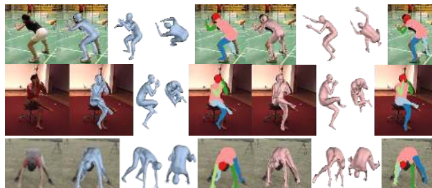
Figure 4: Results with and without paired 3D supervision. 3D reconstructions, without direct 3D supervision, are very close to those of the supervised model.

The results are surprisingly competitive given this chal-