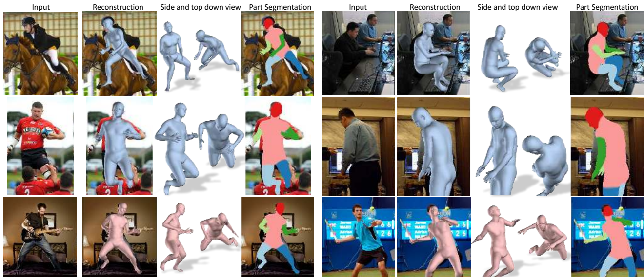
Figure 1: Human Mesh Recovery (HMR): End-to-end adversarial learning of human pose and shape. We describe a real time framework for recovering the 3D joint angles and shape of the body from a single RGB image. The first two rows show results from our model trained with some 2D-to-3D supervision, the bottom row shows results from a model that is trained in a fully weakly-supervised manner without using any paired 2D-to-3D supervision. We infer the full 3D body even in case of occlusions and truncations. Note that we capture head and limb orientations.

{kanazawa,malik}@eecs.berkeley.edu, black@tuebingen.mpg.de, djacobs@umiacs.umd.edu