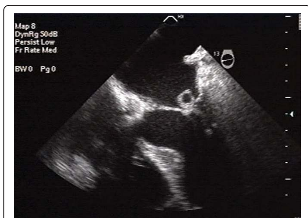
Figure 1 Transesophageal echocardiogram. A rounded mass, 1 cm in diameter, attached to the auricular side of the anterior mitral valve leaflet, compatible with vegetation and abscess, is observed. A smaller mass, 0.5 cm in diameter, is observed on top of the above-mentioned mass, causing mild mitral failure.

In the population analysis of SA2 and SA3, a development of colonies up to 3 and 4 µg/mL, respectively, was observed, with growth between 1 and 4 µg/mL, which was 2 to 4 logs more than in SA1, which developed up to 2 µg/mL (Figure 2). SA2 and SA3 were identified as heterogeneous vancomycin-intermediate S. aureus (hVISA) on the basis of the population analysis profiling-area under the curve (PAP-AUC) ratios, showing PAP-AUC ratios of 1.06 and 1.26, respectively, compared to the AUC of the Mu3 strain, whereas SA1 was identified as vancomycin-susceptible, showing a PAP-