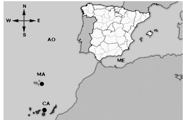
FIG. 1. – Map of the central North Atlantic (AO) showing sampling locations (black circles) at the Madeira Islands (MA) and Canary Islands (CA). (ME) Mediterranean Sea.

Samples of oceanic horse mackerel, T. picturatus , were obtained from commercial fish landings at the Madeira Islands (33°7'30''N, 16°16'30''W) and Canary Islands (28°16'7''N, 16°36'20''W) from January to March 2009 (first sampling period) and April to June 2009 (second sampling period) (Fig. 1). Additionally,