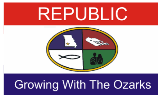
Official flag of the City of Republic, Missouri (1991–1999)

A modern example is the City of Republic in southwestern Missouri. 93 After running a contest for a city flag and seal, the local government chose an elliptical shape with symbols in four quadrants. On the bottom half were images of a traditional nuclear family and a fish, or ichthys , commonly associated with Christianity. The seal was displayed on city buildings, city vehicles, city stationery, and city-limit signs. 94 A local minister declared that the ACLU had correctly associated the ichthys with Jesus Christ, adding, “I say the line is drawn. Stay out of Republic. We’re going to stand for Christian principles.” 95