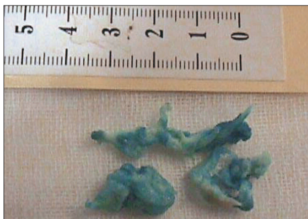
Fig. 2. Disc fragments removed by endoscope.