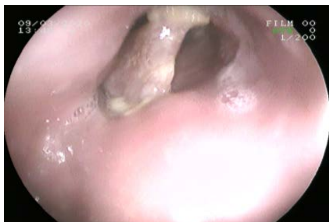
Figure 2. An ingested wear denture remove in the esophagus of a patient aged 66.

showed that it was localized in the small intestine ( Figure 3 ). Two days later, these materials were ejected alone with feces with neither symptoms nor mucosa lesion of the upper digestive tract ( Figure 4 ).