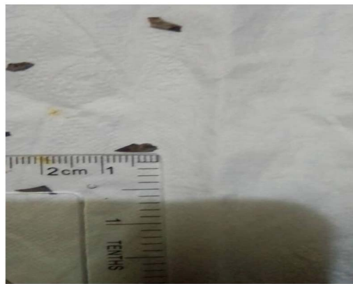
Figure 4. Blade remains in feces.

trachea-bronchia and also in the upper esophageal areas [16]. In case of perforation, the patient is treated by surgeons [7]. They do not associate gastroenterologists most of the time.