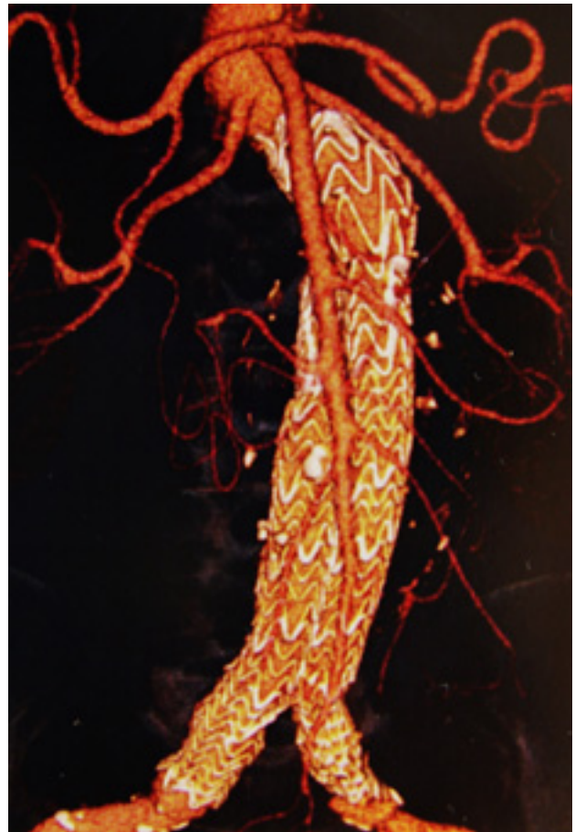
Figure 1 - AngioCT-3D of patient with abdominal aortic aneurysm (7.2 cm in diameter) treated with an Excluder® bifurcated stent-graft

The main objective of this study was to evaluate patients' operative mortality and late survival rate. Secondary objectives were to determine primary and secondary patency rates, frequency of reinterventions and outcome of the aneurysm sacs after stent-graft implantation. Operative mortality was defined as death during initial hospital stay or death due to any cause up to 30 days after stent-graft implantation. Reintervention was defined as any surgical or endovascular procedure performed immediately or some time after stent-graft implantation, in order to maintain a satisfactory clinical outcome or to treat a specific complication related to the stent-graft or the aneurysm. The outcome of the aneurysm sac was evaluated by postoperative measurement of aneurysm cross-sectional diameter in tomographies performed during follow-up.