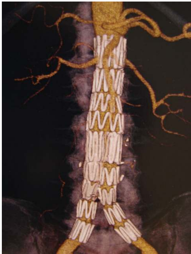
Figure 2 - AngioCT-3D of patient with abdominal aortic aneurysm (6.3 cm in diameter) treated with a Zenith® bifurcated stent-graft