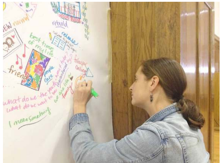
Figure 3: The Visual Explorer™ activity provided an entry point into discussion and storytelling.