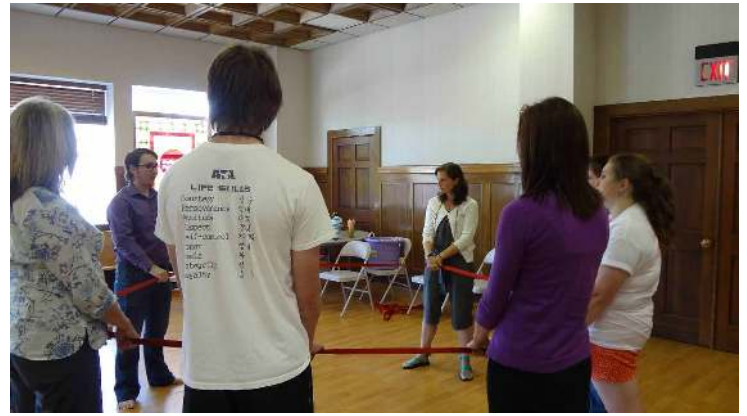
Figures 1 and 2: The YCDR2 workshops began with trust and relationship-building activities, and facilitated games, such as the Magic Carpet Ride (left) and the Unity Circle (right).