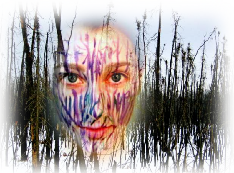
Slave Lake is still home to me.