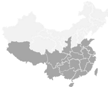
Figure 1. China's bamboo growing province map [3]

Bamboo is a traditional material used for construction in ancient China. In general bamboo's mechanical and durability properties are comparable or exceeding values of the materials used traditionally in construction, like concrete or timber [1]. China is the main origin of bamboo in the world, considering the species, distribution area and quantity [2]. Bamboo is distributed in a wide range in China, see Figure 1; in four provinces: Fujian, Zhejiang, Jiangxi and Hunan, it occupies about 60.8% of China bamboo forest area [3]. In the world, there are bamboos of total 150 genera, 1,253 species and 2,200 million hectares. Bamboos in China have 43 genera, 707 species and the distribution area of bamboo in China covers about 700 million hectares [2]. The major bamboo species in China is Moso bamboo.