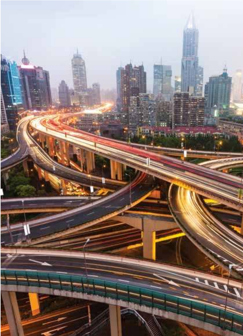
Mega cities and future transportation.