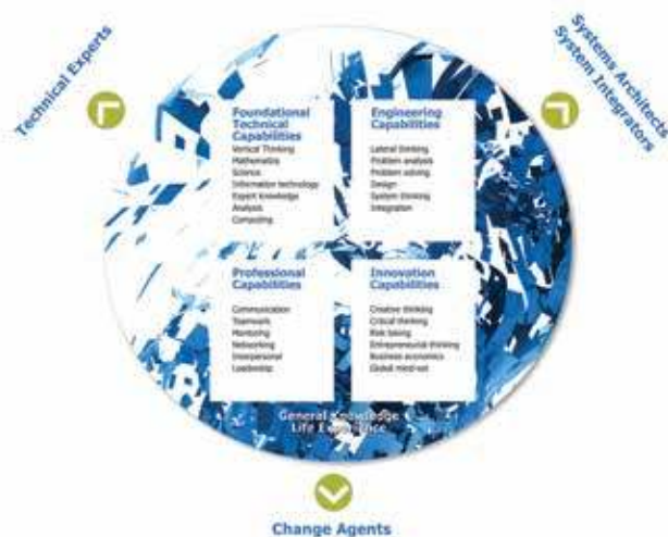
Main knowledge and capability areas for three career choices of an Engineering graduate, based on the Well-Rounded Engineer in McMaster's (2005)

grated problem-based and challenge-based learning, or around historic cases and issues that are of personal and societal significance in the real world, in which disciplinary knowledge is used beyond its boundaries.