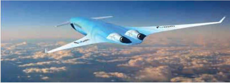
Future aircraft. Design of a sustainable and environmental-friendly aircraft.

systems thinking, interdisciplinary thinking in which engineering domains as well as socio-economic factors are considered, creative thinking, communication and collaboration, and a global mind-set, are the key capabilities for the engineer in the 21st century. These attributes are not new, but their relative importance is shifting and will shift further in the coming decennia. There is a strong consensus that the most important capability that an engineering graduate should have is a positive attitude towards lifelong learning. In the new world of work it is no longer what an engineer knows, but how he learns and is able to apply what he learns that makes his career successful. Lifelong learning is the most important employability skill for the engineer of the future.