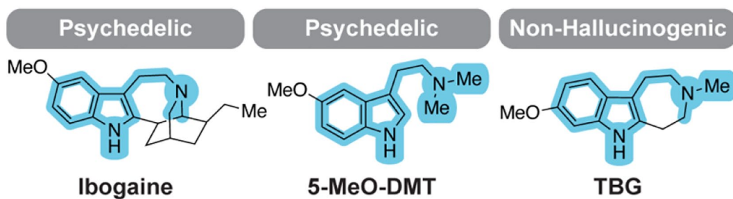
Figure 2. Structural similarities of ibogaine, 5-MeO-DMT, and TBG. The common N,N -dimethyltryptamine core of all 3 molecules is highlighted.

bottom-up mesolimbic circuits, while therapeutic memories involve top-down corticolimbic circuits. Thus, treatments that enhance activity in corticolimbic circuits are potentially useful for treating addiction and related disorders involving cortical atrophy such as PTSD and depression.