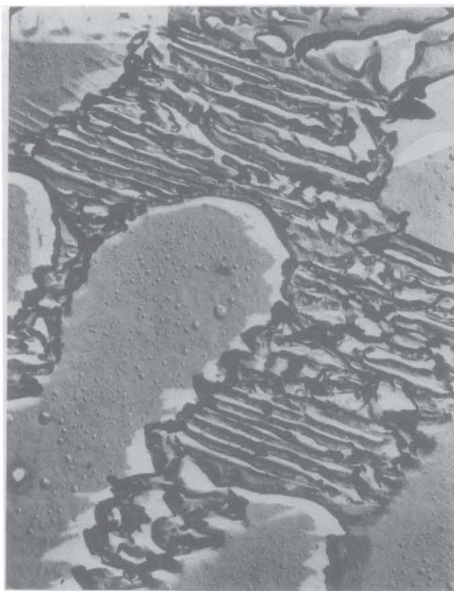
Fig. 2. Transmission electron microscopy replica of Ir_{0.95}Y_{0.05} showing the lamellar eutectic together with elemental iridium ( \times 24,000 ).