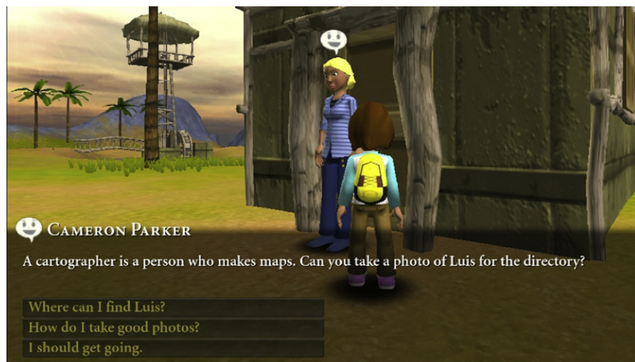
Fig. 1. Image taken of interaction between student avatar and character from CRYSTAL ISLAND.

Students played the CRYSTAL ISLAND (see Figs. 1 and 2) game after they had exposure to the curriculum landforms that related to the North Carolina standard course of study for fifth grade science. CRYSTAL ISLAND is an online computer game consisting of an immersive, 3-dimensional intelligent learning environment with a cast of characters situated on an island within a storyworld. It is in its third year of development as a NSF-funded, multidisciplinary project. For a virtual walkthrough of the game see http://www.intellimedia.ncsu.edu/videos/CI5-yearTwo-video.html . This version features an expansive island setting that has rivers, a delta, a dam, a plateau, a lake, several waterfalls, and a beach. Throughout gameplay, students have the opportunity to interact with characters (e.g., town mayor, citizens of the island) to learn about science related concepts and to obtain advice and guidance pertaining to game scenario completion. The CRYSTAL ISLAND content curriculum was generated from FOSS (Full Option Science System) and the NC standard course of study on landforms and ecosystems. One theoretical underpinning for CRYSTAL ISLAND is narrative-centered learning. Mott, Callaway, Zettlemyer, Lee, and Lester (1999) introduced the theory of narrative-centered learning to virtual worlds by building on Gerrig's (1993) two principles of cognitive processes in narrative