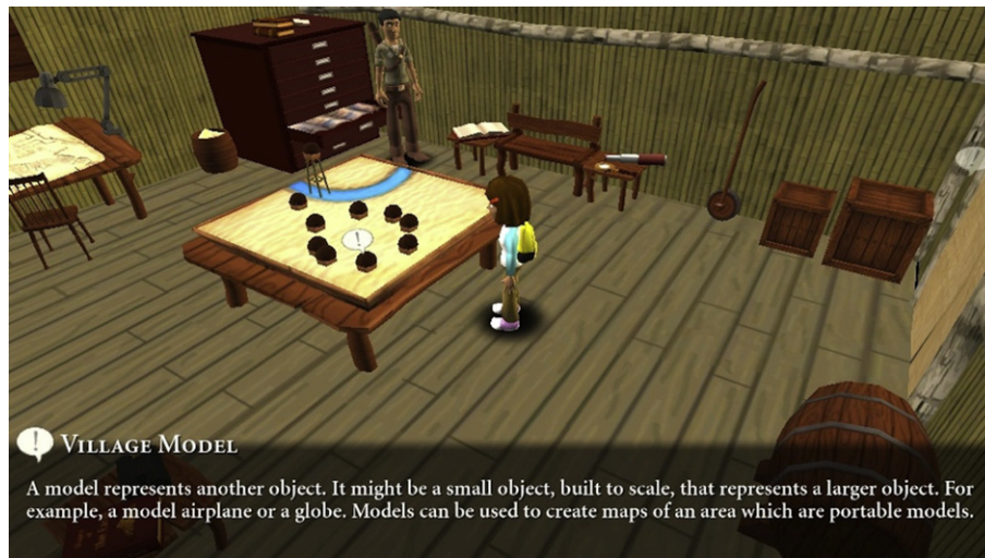
Fig. 2. Image taken of student avatar learning about models in CRYSTAL ISLAND.

comprehension. First, readers are transported; they are somehow taken to another place and time in a manner that is so compelling it seems real. Second, they perform the narrative. Simulating actors in a play, readers actively draw inferences and experience emotions prompted from interactions with the narrative text. Students learn content as they experience the narrative.