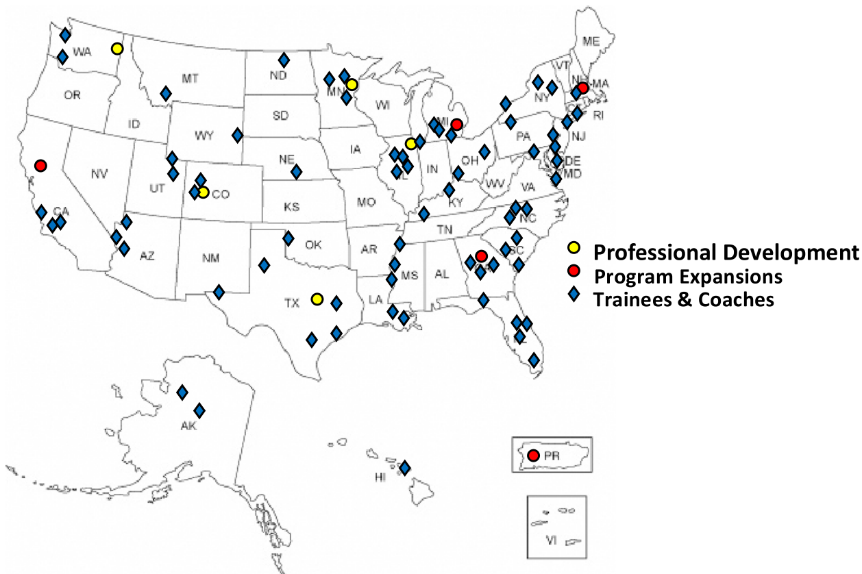
Fig. 2 National Presence of Professional Development Core. NRMN's Grantwriting and Professional Development Programs' expansion. Original location of NRMN Grantwriting and Professional Development Program sites (yellow circle); new expansion sites (red circle) and location of Mentees and Coaches-In-Training (blue diamond) across the United States