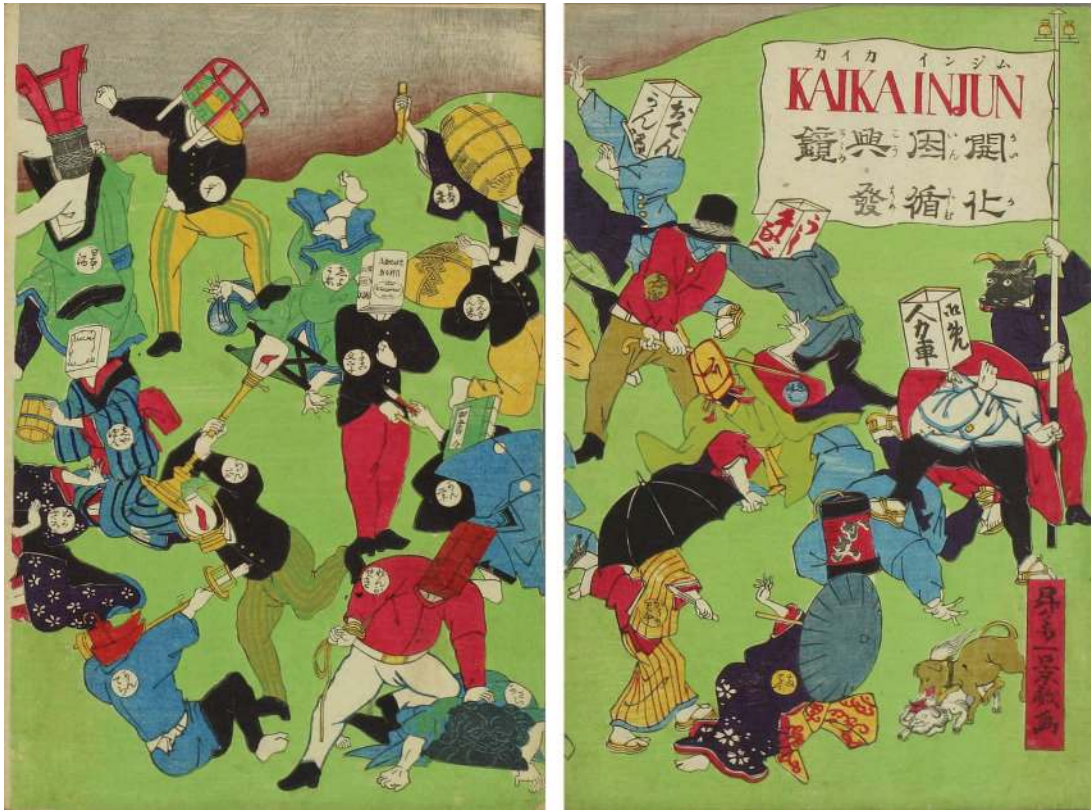
FIGURE 3, cont'd

work, has reconstructed the way in which Edward Gibbon engaged with many different “Enlightenments.” 9 Jonathan Israel and others have significantly extended the perspective backward in time and thereby complicated our understanding of the Enlightenment. 10 A second strand of scholarship has looked at the social history of ideas and communication, thus further contributing to the idea of Enlightenment heterogeneity. As soon as the focus is moved from lofty philosophical debates to the material production of the public sphere and to the forms of popular mentalities, the picture becomes much less uniform. The Enlightenment, broadly conceived, was thus fragmented, socially and across gender lines. 11 The entrenched dichotomy of Enlightenment and Counter-Enlightenment has also been called into question. 12