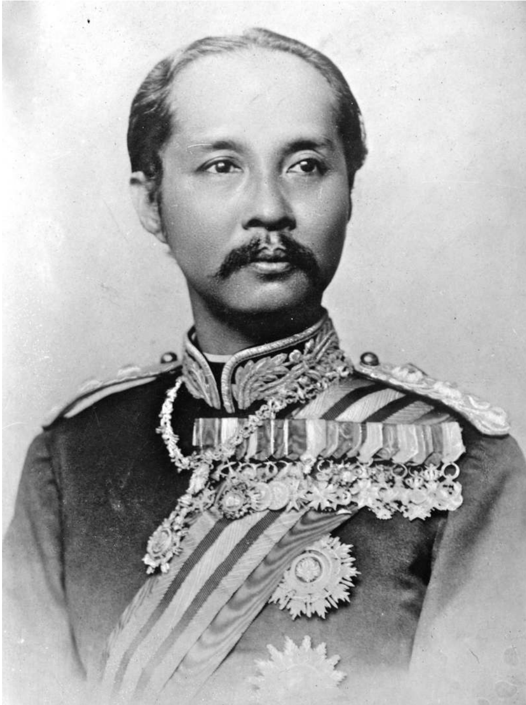
FIGURE 5: King Chulalongkorn of Siam (Rama V, r. 1868–1910) continued the modernizing reforms that his father, King Mongkut, had initiated. After study tours to neighboring countries such as Dutch Java and the British colonies of Singapore, India, and Burma, he embarked on a trip to Europe in 1897 and “saw that there is more to do than there is time.” He meticulously noted the differences between England and Russia, Hungary and Switzerland (“similar to Java, but 100 times prettier”), Italy, Austria, and Portugal (“I have not seen a country worse than this”). His political and social reforms went beyond the introduction of Western technology and extended to the bureaucracy and the legal system, while his fusion of European ideas of just government with Theravada Buddhist concepts of kingship was to ensure his position of absolutist ruler and enlightened monarch at the same time. George Grantham Bain Collection, Library of Congress Prints and Photographs Division, Washington, D.C., LC-DIG-ggbain-05360.