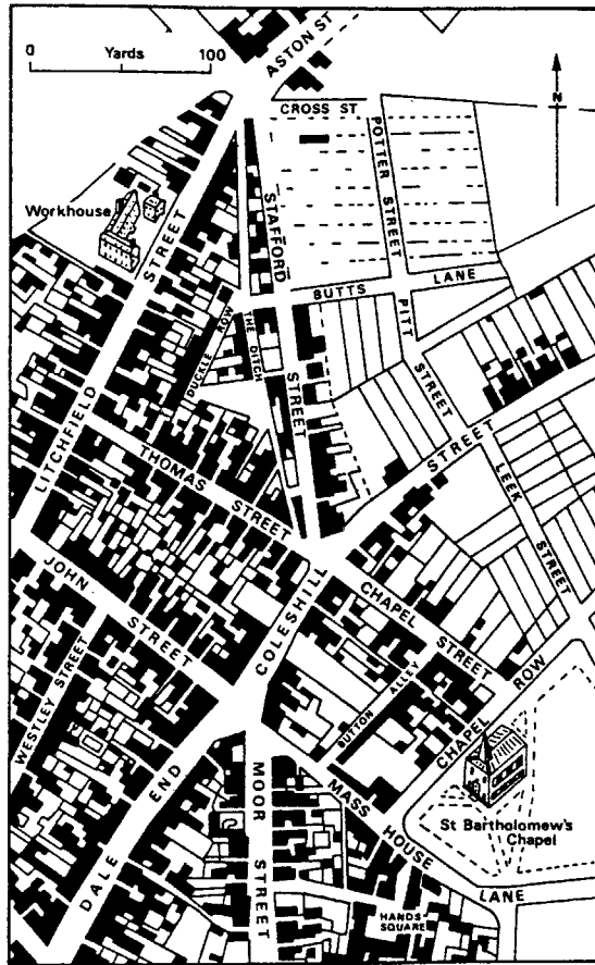
FIGURE 1. Section from Bradford's Map of Birmingham 1750.

in and around the city center. Increases in the value of land promoted "in-filling" in the gardens behind the grand houses and "polite terraces" left over from earlier decades. Most of the new dwellings were for impoverished workers and consisted of only two or three rooms (Chalklin, 1974: 107-108, 196-197).