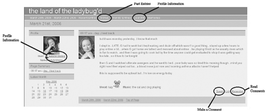
FIGURE 1. Visual layout of a typical LiveJournal blog

'reading' blogs – the content of blog pages. It is almost like one needs to learn not only how to read blogs but also how to view them.