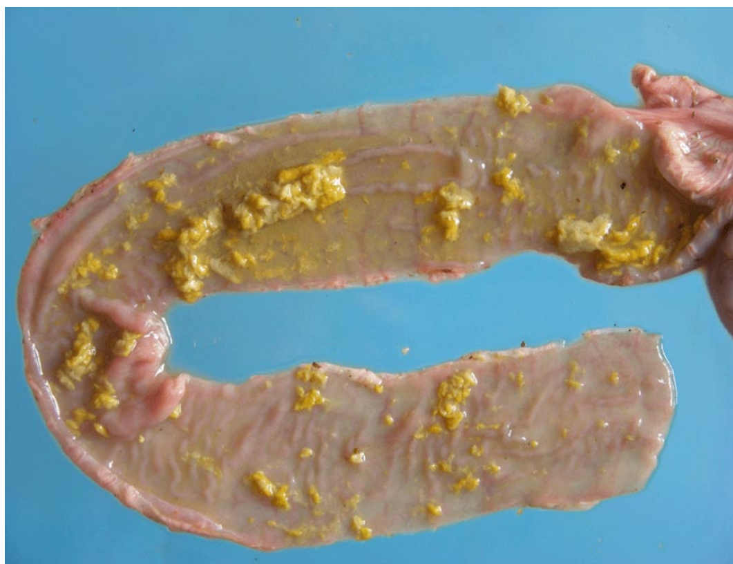
Figure 1 - Wild boar, Ileum. Wall thickening with white-yellowish fluids and flakes scattered over the mucosal surface.

(LAWSON & GEBHART, 2000) due to L. intracellularis infection. Additionally, some lesions were similar to that reported in an outbreak of PCV2 infection in wild boars (CORRÊA et al., 2006).