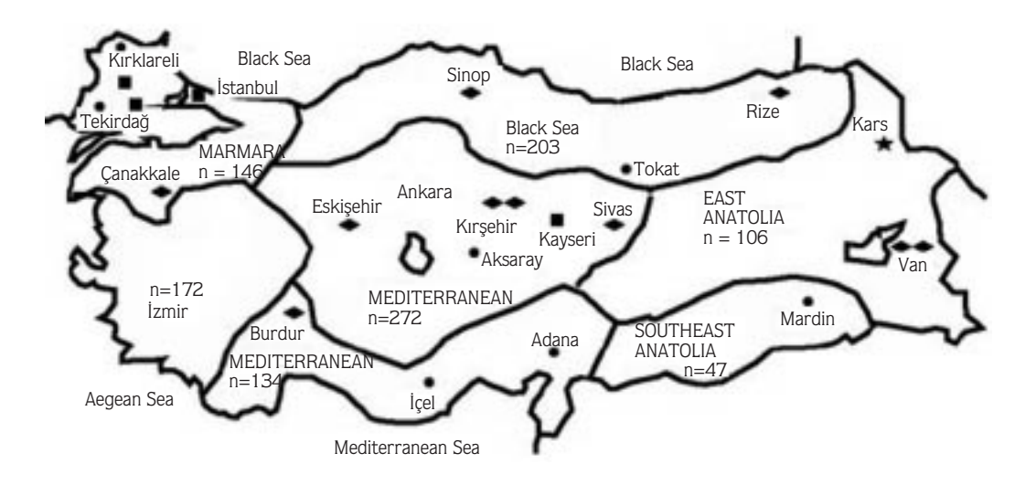
Figure 3. Map of Turkey showing the positive sites where entomopathogenic nematodes were recovered. References: ■ H. bacteriophora, ● S. affine, ◆ S. feltiae, ★ Steinernema anatoliense, n=number of soil samples taken within regions.

foraging strategies to locate and infect hosts, which range from one extreme of sit-and-wait (ambush) to the other of widely foraging strategy (cruise) (74,75). Most nematode species are situated somewhere along a continuum between these 2 extremes, placing them as intermediate foraging strategists (e.g. S. riobrave and S. feltiae) (76-78). These intermediate strategists are adapted to infecting insects that occur just below the soil surface, such as prepupae of lepidopterous insects, fungus gnats, or weevil larvae. The sit-and-wait strategists or ambushers (e.g. S. carpocapsae and S. scapterisci) are characterized by low motility and a tendency to stay near the soil surface. They tend not to respond to volatile and contact host cues unless presented in an appropriate sequence and efficiently infect mobile host species such as the codling moth, cutworms and mole crickets near the soil surface. At the other extreme, the widely foraging strategists or cruisers (e.g. S. glaseri and H. bacteriophora ) are characterized by high motility and are distributed throughout the soil profile. They orient to volatile host cues and switch to a localized search after host contact and are well adapted to infecting sedentary hosts such as scarab and lepidopterous prepupae and pupae.