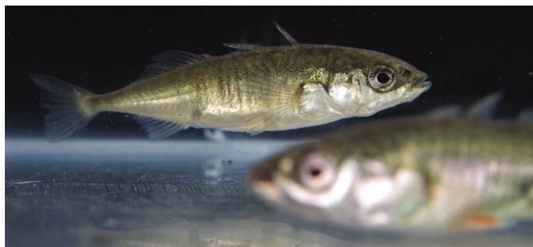
Threespine sticklebacks Gasterosteus aculeatus .

Associate Editor: Jay Stachowicz Editor: Troy Day