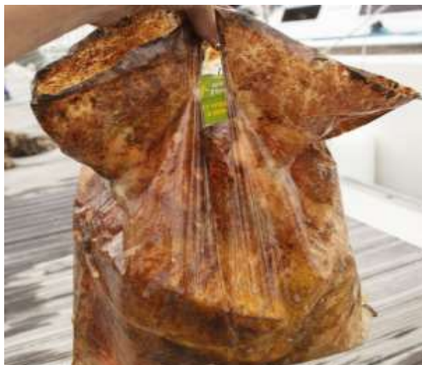
28 29 30 31 A carrier bag labelled as biodegradable after 3 32 years in the marine environment

33 34 35 like to thank the Marine Biology and Centre (MBERC) Electron for their help project.