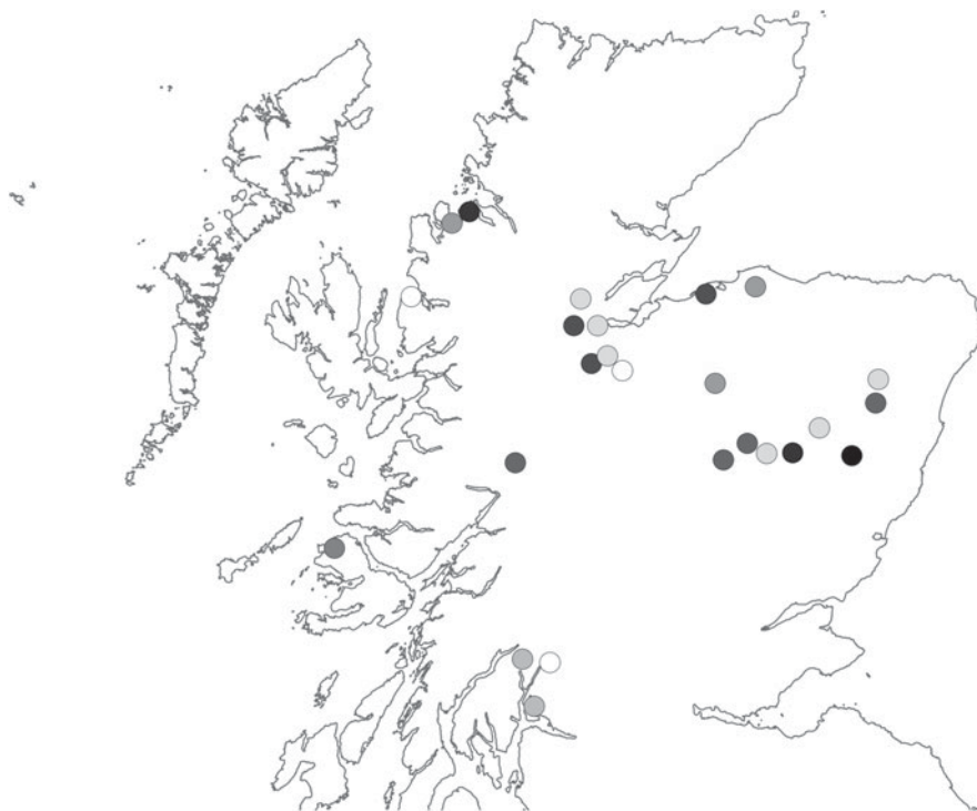
Fig. 1. Prevalence of Borrelia burgdorferi s.l. in questing nymph Ixodes ricinus ticks in woodlands in Scotland. Gray scale denotes prevalence, ranging from the lowest (white) at 0.8% to the highest (black) at 13.9%.

Nymph I. ricinus ticks were assayed from 1218 individual blanket drags for B. burgdorferi s.l. (we did not have the time and resources to assay nymphs from all drags, but we ensured that we assayed a minimum of 50 nymphs from each site). The prevalence of B. burgdorferi s.l. at each site was calculated as the number of positive nymphs/number of nymphs assayed per site. The overall prevalence in questing nymphs from all 25 sites was 5.6% ( \pm 1.0\% , range 0.8–13.9%, Fig. 1). Of those positive samples that we successfully identified to genospecies level, 48% were B. afzelii , 36% B. garinii , 7% B. burgdorferi s.s., 8% B. valaisiana and 1% carried mixed infections of 2 or more genospecies. The number of samples successfully identified to each genospecies was not large enough for conducting meaningful statistical analyses to test for predictive environmental variables, so this was done only for B. burgdorferi s.l. prevalence as a whole, at the site level.