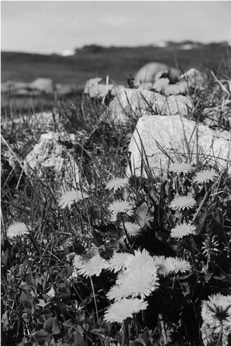
FIGURE 3 Dandelions ( Taraxacum officinale ) and clover ( Trifolium spp) growing along the edge of one of the gravel tracks near Mt Kosciuszko. Gravel track types often have a weed verge, whereas other track types, such as raised steel mesh walkways, do not provide weed habitat. Weeds are a problem in the alpine area; the diversity and abundance of weeds is likely to increase with predicted climate change.