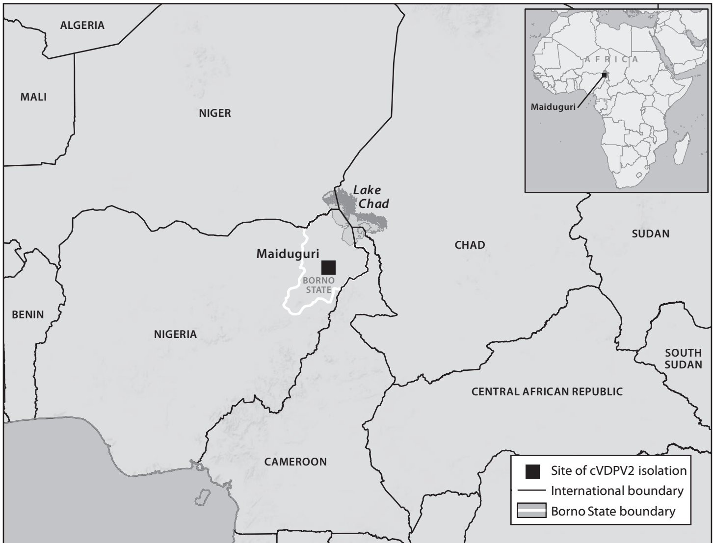
FIGURE 1. Location of the laboratory-confirmed circulating vaccine-derived poliovirus type 2 (cVDPV2) isolate reported from an environmental sewage sample — Maiduguri, Borno State, Nigeria, April 29, 2016