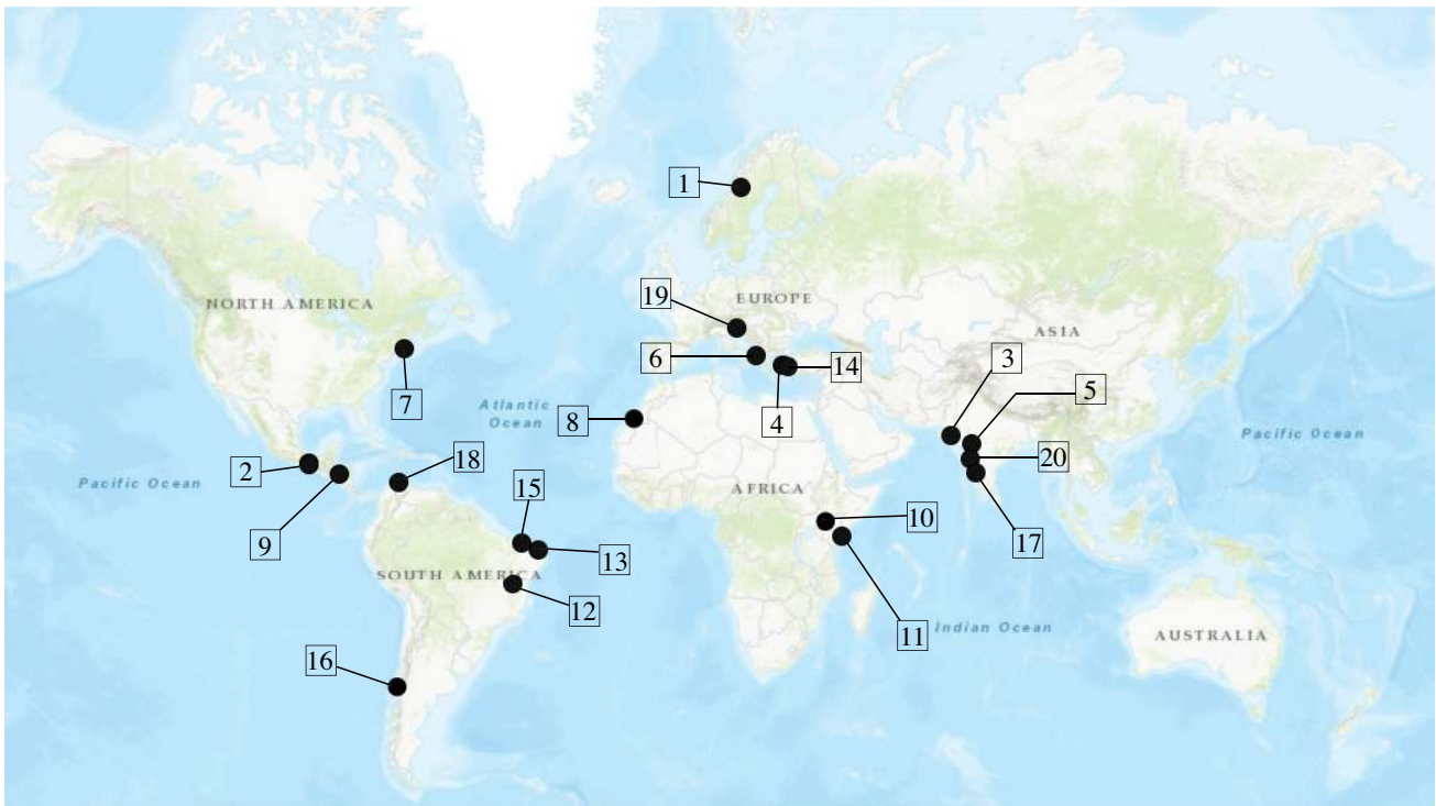
FIGURE 1: INVENTORY OF CONFLICTS: GEOGRAPHICAL LOCATIONS

Own elaboration based on www.ejatlases.com