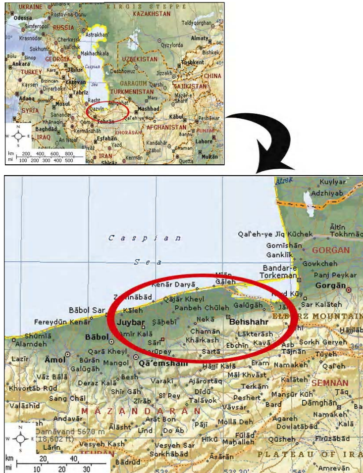
Fig. 1: Geographic location of the study area along the southern coast of the Caspian Sea, between Juybar and Behshahr regions