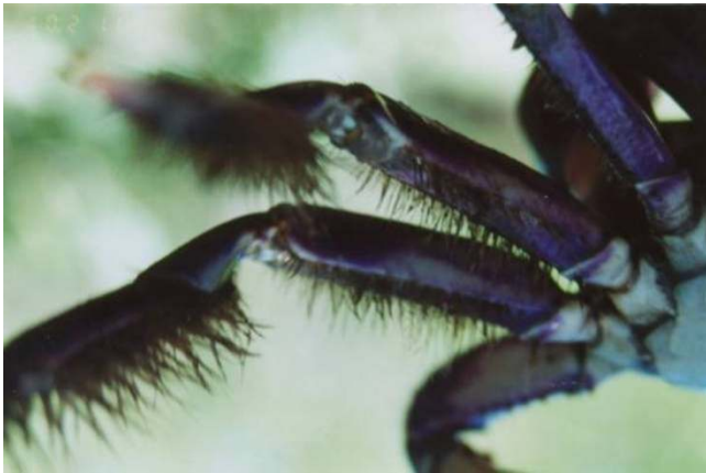
Figure 6 Hairy legs of Ucides cordatus males.

obtained from gatherers. Marques [45] also reported the gathering of relevant local information on the diet of an estuarine fish ( Arius herzbergii , Ariidae).