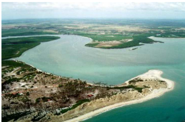
Figure 2 Aerial view of River Mamanguape estuary.

traditional human populations, of which nearly 80% were published over the last 20 years, and mainly in the last decade.