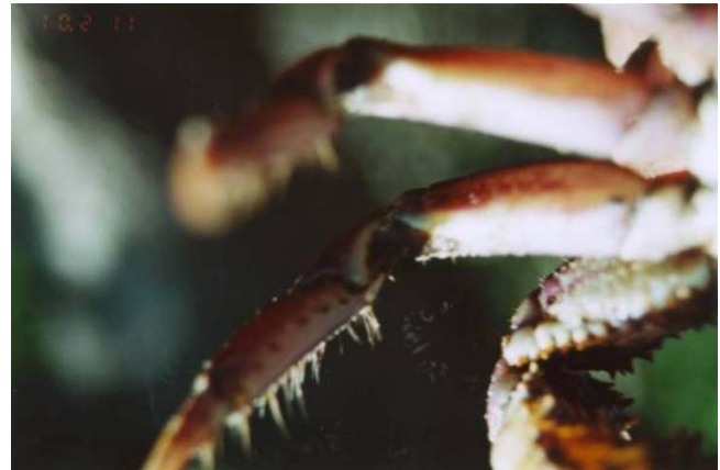
Figure 5 Legs of Ucides cordatus females virtually without hairs.

The correlation analysis showed that the crab morphometric values of length and width, as well as burrow opening dimensions were the main variables which had a significant association. The following conclusions can be reached from our results: carapace height was weakly correlated with burrow opening height ( r = 0.37 ) and with burrow opening width ( r = 0.40 ), probably because U. cordatus individuals enter the burrow by flexing their chelipeds frontally to the body, in a way that the longest axis of the burrow opening (its height) corresponds to the carapace height (Figure 3). This lateral movement of young