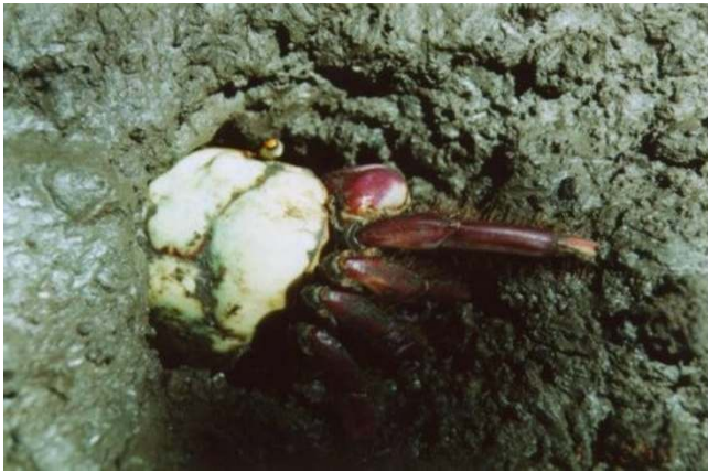
Figure 4 Ucides cordatus specimen entering the burrow.

5), and leave thin deep tracks at the burrow entrance, in opposition to the hairy legs of males (Fig. 6), leaving relatively wide and shallow tracks. Figure 7 shows a land-crab gatherer during harvesting activities.