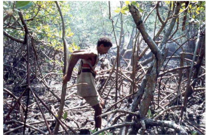
Figure 7 Gatherer of the land crab 'caranguejo uçá' ( Ucides cordatus ) in the mangrove habitat the River Mamanguape estuary.

In the State of Paraíba the law prohibits that females of any size and males smaller than 4.5 cm of carapace length be captured. We believe that the re-examination of the existing laws of crab harvesting and other crustaceans are urgently needed for the preservation of natural stocks of these animals. The gatherer's environmental perception and its consequent influence on capture efficiency, are the main factors to be considered when making decisions