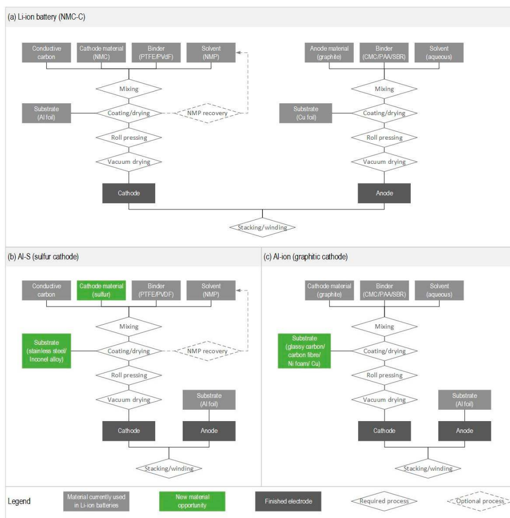
Figure 2. Electrode production requirements for (a) a Li-ion battery with NMC cathode and graphitic anode; (b) an Al-S battery with sulfur cathode and aluminum anode; and (c) an Al-ion battery with graphitic cathode and aluminum anode. Abbreviations: NMC—lithium nickel-manganese-cobalt oxide, PTFE—polytetrafluoroethylene, PVDF—polyvinylidene difluoride, NMP— N -methyl-2-pyrrolidone, CMC—carboxymethyl cellulose, PAA—polyacrylic acid, and SBR—styrene butadiene rubber.