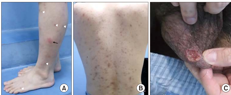
Figure 2. Cutaneous manifestations of Behçet's disease (BD). (A) Erythema nodosum-like lesion (arrow) and concurrent papulopustular lesions (white arrowheads) in lower leg. (B, C) Papulopustular lesion on trunk (B) and a scrotal ulcer in a male patient with BD.

pyoderma gangrenosum, and erythema multiforme-like lesions are also seen. Ocular manifestations of disease vary depending on site of involvement and include iridocyclitis, keratitis, episcleritis, scleritis, vitritis, and classic posterior uveitis, including retinal vasculitis and optic neuritis. Severe involvement of the posterior chamber is particularly related to visual morbidity. A nationwide analysis revealed that BD was an important clinical risk factor for blindness in Korean patients with non-anterior uveitis [16].