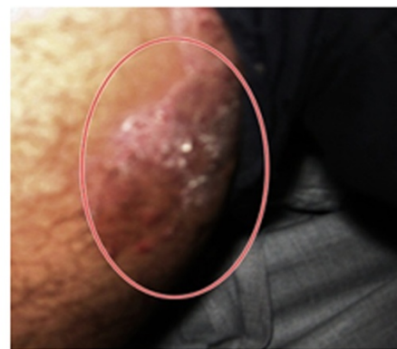
b. Tinea cruris