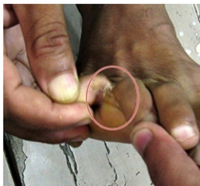
c. Tinea pedis