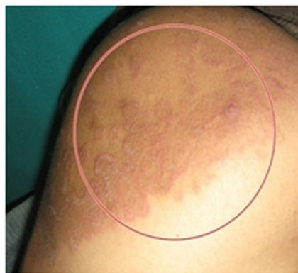
a. Tinea corporis

hyphae (pencil shaped, spiral, pyriform, septations etc.), microconidia and macroconidia (tear shaped, drop like, spherical, in bunches, abundance or rare etc.). Trichophyton rubrum (ATCC-28188), T. mentagrophyte (ATCC-18748) and Microsporum gypseum (ATCC-24102) obtained