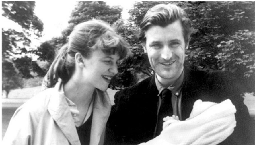
Figure 6 Sylvia Plath and Ted Hughes. In his poem about Plath's suicide, 'Last letter' Hughes wrote 'what happened that night ... is as unknown as if it never happened. What accumulation of your whole life, like effort unconscious, like birth pushing through the membrane of each slow second into the next, happened only as if it could not happen' 207

contribution of smoking to the population burden of lung cancer that <10% of variance accounted for by cigarette smoking among individuals observed in prospective epidemiological studies, and the 12% shared environmental variance reported in Table 1, should be considered. The shared environmental component will in part reflect shared environmental differences in cigarette smoking initiation. 144 The non-shared environmental component (62% of the variance in Table 1) will include the non-shared environmental influence on initiation, amount and persistence of smoking. 144 However, as discussed earlier, stable aspects of the non-shared environment—which smoking would tend to be—are generally small contributors to the total non-shared environmental effect, and thus much of this will also reflect the substantial contribution of the kinds of chance events—from the sub-cellular to the biographical—discussed above. Richard Doll, reflecting on the 50th anniversary of the publication of his classic paper with Peter Armitage on the multi-stage theory of carcinogenesis 145 considered that