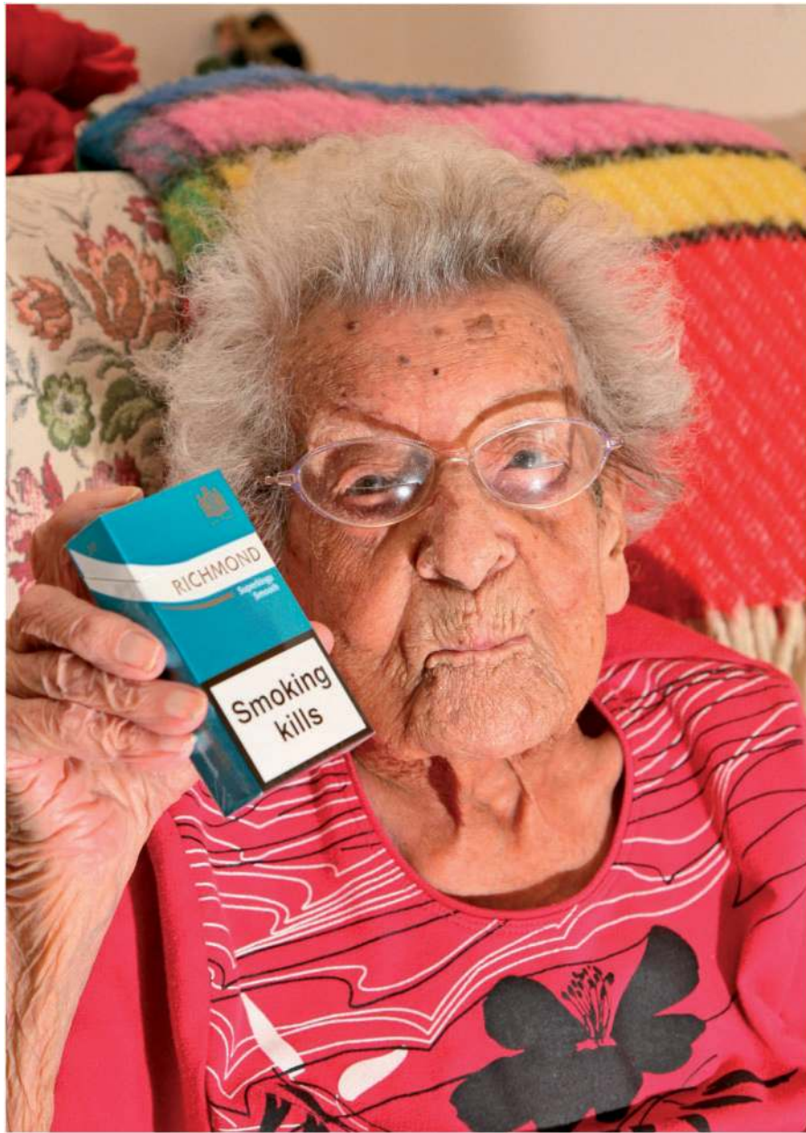
Figure 7 Winnie: the tail of a distribution or a 'black swan'?

population and variations over time or between populations—can be found in the writings of such disparate figures as R.A. Fisher, 152 Sewall Wright 153,154 and Richard Lewontin, 155 although with greatly varying emphasis. Epidemiologists and other population health scientists have drawn out the implications of this well-established and non-controversial insight in ways that link it with classical epidemiological reasoning (Box 5). 156–158