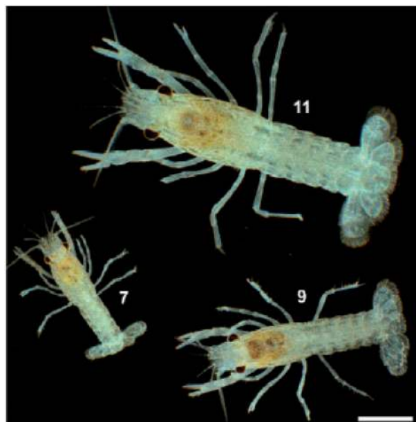
Figure 5 Variation of growth of genetically identical marbled crayfish in an aquarium: how well would epidemiologists be able to predict outcomes? 94

In model organism studies trait deviations due to developmental noise tend to be independent of one another, 104 reflecting the generally non-stable