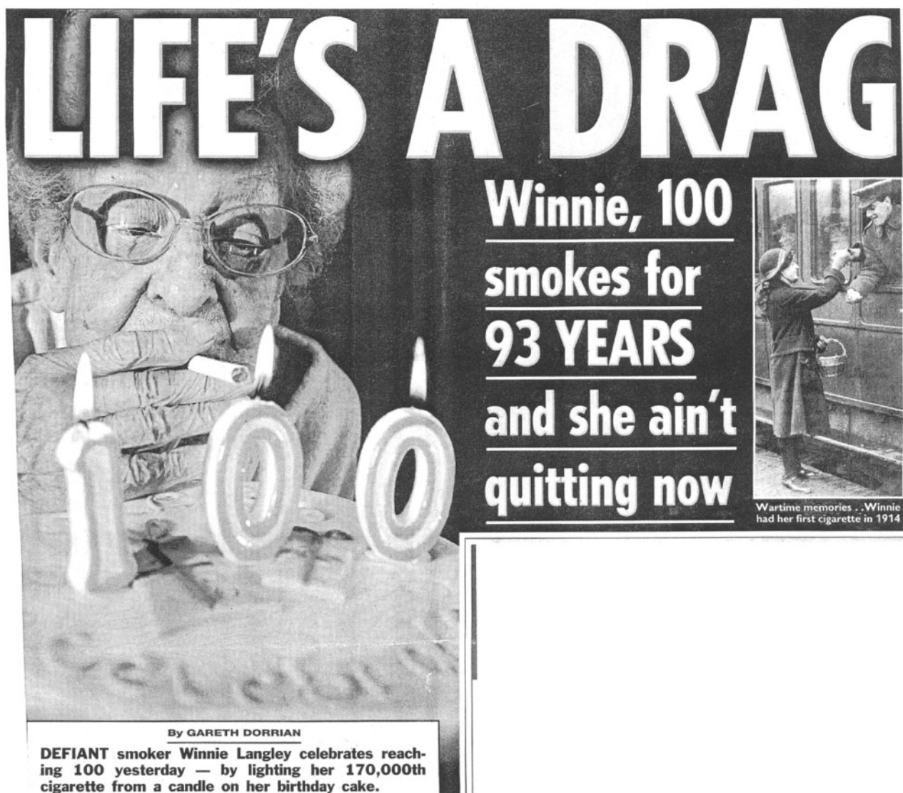
Figure 1 Winnie ain't quitting now

living, loom large in the popular imagination 2 and are reflected in the low positive predictive values and C statistics in many formal epidemiological prediction models. In general, epidemiologists do a rather poor job of predicting who is and who is not going to develop disease.