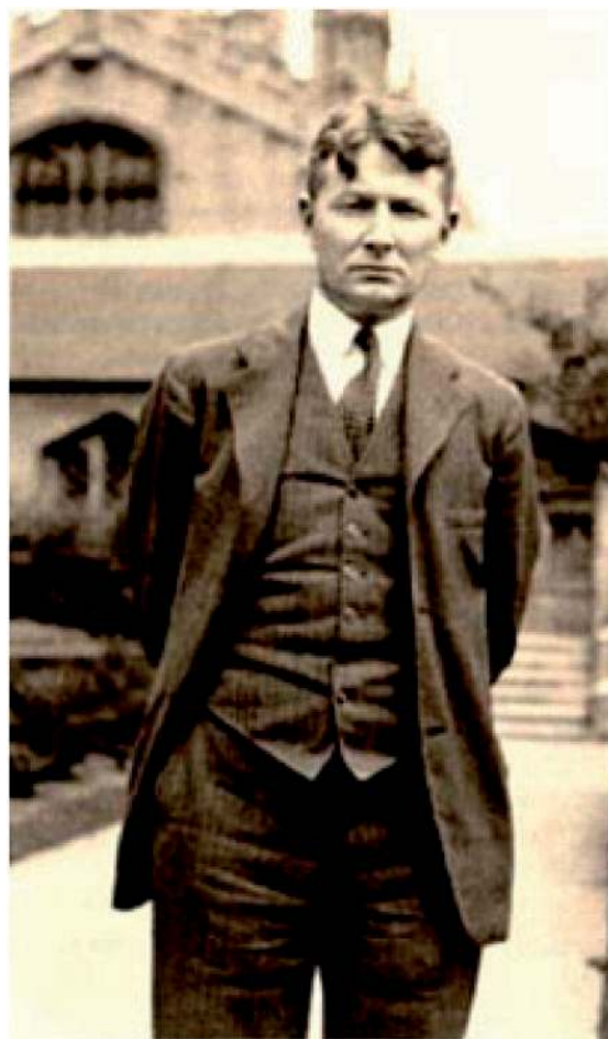
Figure 2 Sewall Wright (1889–1988). Source: Sewall Wright and Evolutionary Biology 154

The pioneering psychiatrist Henry Maudsley was present at a meeting of the newly founded Sociological Society in April 1904 when Sir Francis Galton talked on 'Eugenics: its definition, scope and aims', 184 and considered how siblings 'born of the same parents and brought up in the same surroundings' could become so different. He concluded that in his opinion 'we shall have to go far deeper down than we have been able to go by any present means of observation—to the germ-composing corpuscles, atoms, electrons, or whatever else there may be; and we shall find these subjected to subtle and most potent influences of mind and body during their formations and combinations, of which we yet know nothing and hardly realise the importance'. 185 Here he is describing how heritability ('germ-composing corpuscles') and factors that would be subsumed under the non-shared environment could come together and that 'in these potent factors the solution of the problem is to be found'. 186 In his reply Galton was scathing. 186 Referring to a discussion that included spoken or written contributions from George Bernard Shaw, H.G. Wells and William Bateson he declared himself unhappy with the quality of the debate, with two speakers that seemed to him 'to be living forty years ago; they displayed so little knowledge of what has been done since', others that 'were really not acquainted with the facts, and they ought not to have spoken at all'.