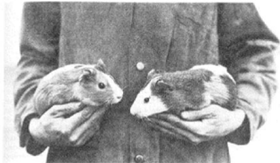
Sewall Wright holding a guinea pig in each hand circa 1920.