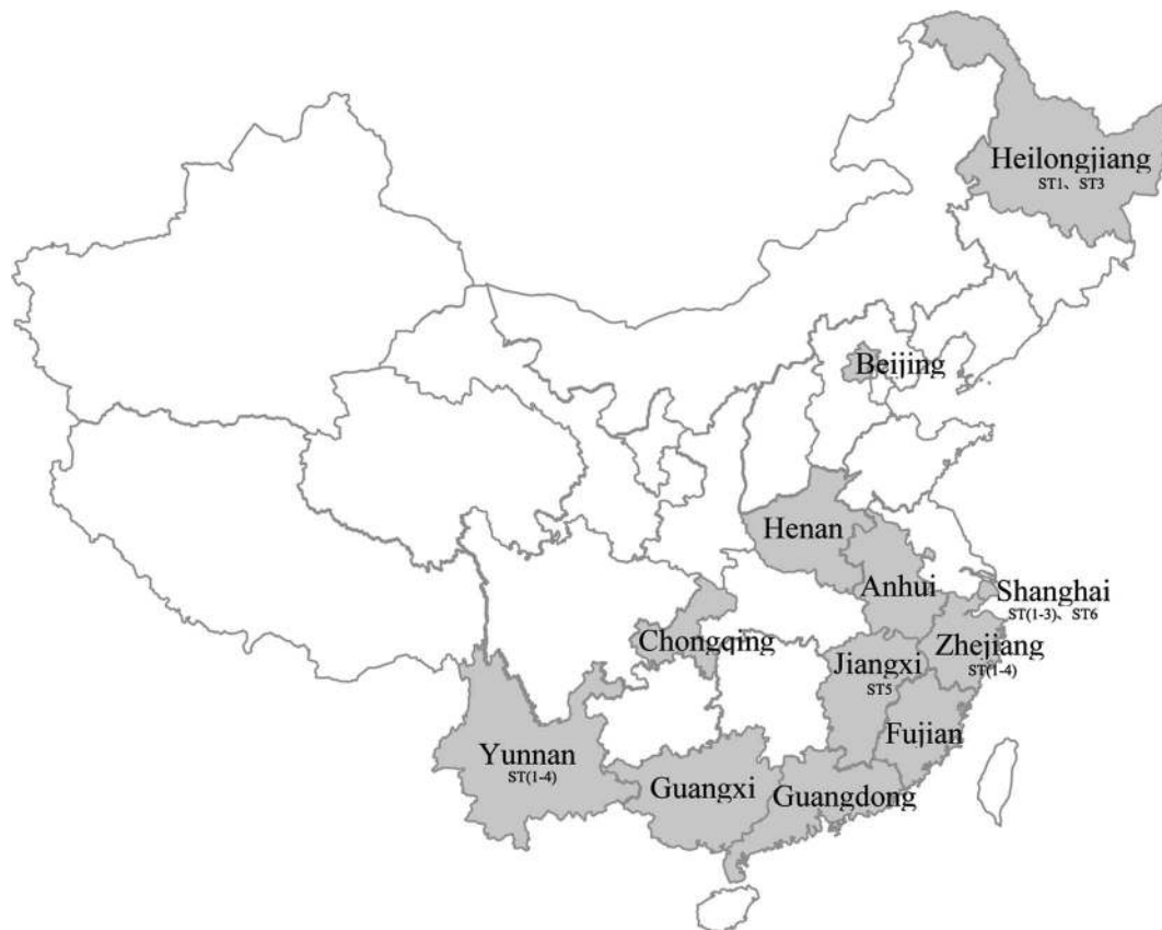
Figure 1. Prevalence of human Blastocystis in different provinces/municipalities in China.

Entamoeba spp., Giardia intestinalis , and Dientamoeba fragilis [49, 63]. Several studies have shown that contaminated water and food with a few number of Blastocystis cysts can establish an infection [17, 62]. Clinical presentations caused by this parasite are very diverse, ranging from self-limiting abdominal discomfort to chronic persistent diarrhea [33]. Frequently, these parasitic infections also present with dermatological symptoms, depending on the different Blastocystis subtypes [14]. Compared to healthy individuals, a higher incidence of Blastocystis has been observed in patients with diarrhea or other gastrointestinal symptoms, especially in patients with irritable bowel syndrome (IBS) symptoms [5, 18]. Since its first descriptions by Alexeieff and Brumpt [12], Blastocystis sp. has been found in a wide host range of animal hosts, including artiodactyls, perissodactyls, proboscideans, rodents and marsupials as well as birds, reptiles, amphibians, fish, annelids, and insects [31, 48]. Blastocystis sp. is included in the Water, Sanitation, and Health programs of the World Health Organization [58].